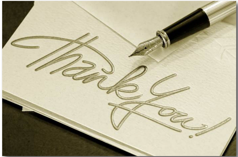
When you get each contribution or pledge, you should immediately write a strong thank you letter.

I probably have as wide a view of what's going on across the country in conservative organizations as anybody. I can assure you there isn't a decline in the amount of money being given.