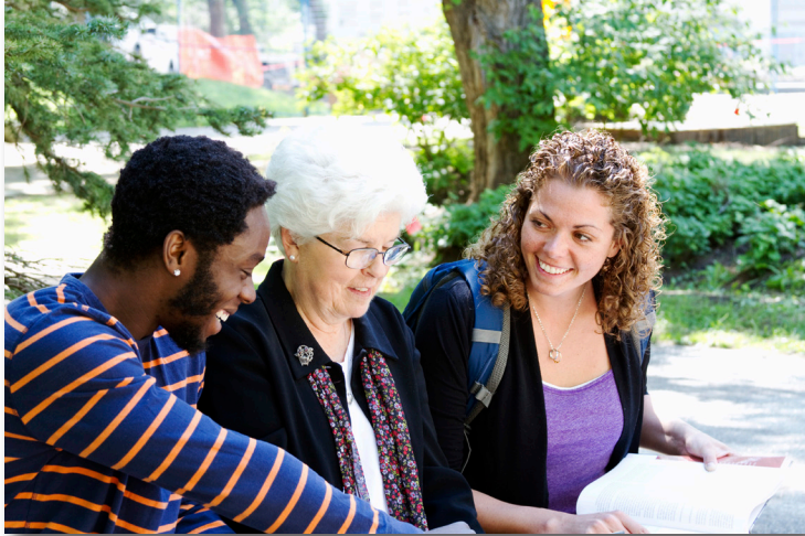
Donors respond best to intelligent students who have a pleasant demeanor and a solid plan of action.

However, don't go overdressed to meet a potential donor. A student who solicits funds in a three-piece, heavy wool suit with a big gold-link watch chain looped across his vest may not seem to be a credible student leader.